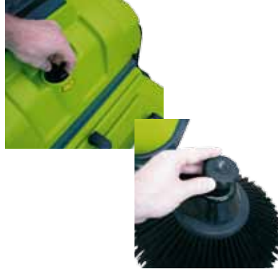
Maximum brush wear saving