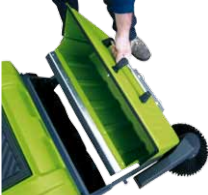
Easy access to internal compartments